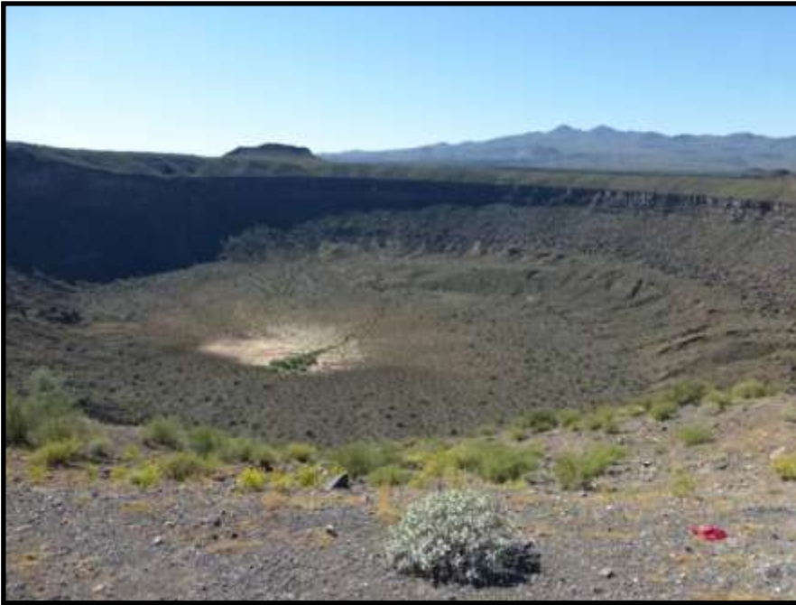
More photos from the Mexican Fiesta—(Clockwise from left) The cinder volcanic crater at Picante Mountain new Rocky Point. Art Ashton takes a breather while hiking to the crater. The view of Cholla Bay from the beach. Local birds in Mexico.